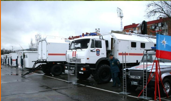
FD EMERCOM Centre (Regional EMERCOM's Agency) command and control post