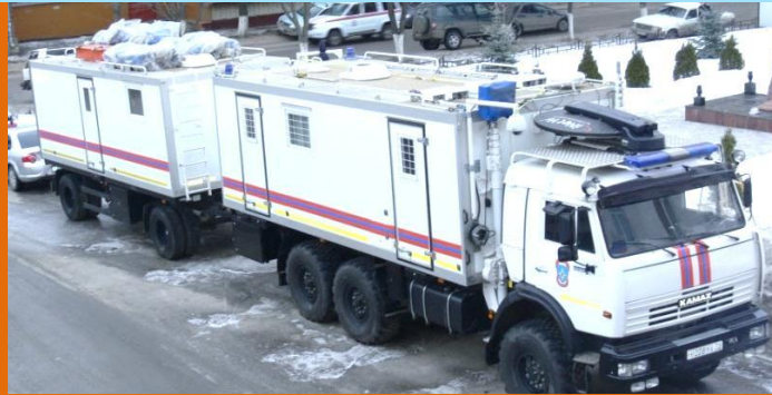
FD mobile control post