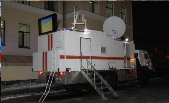
Multitask command and control centre