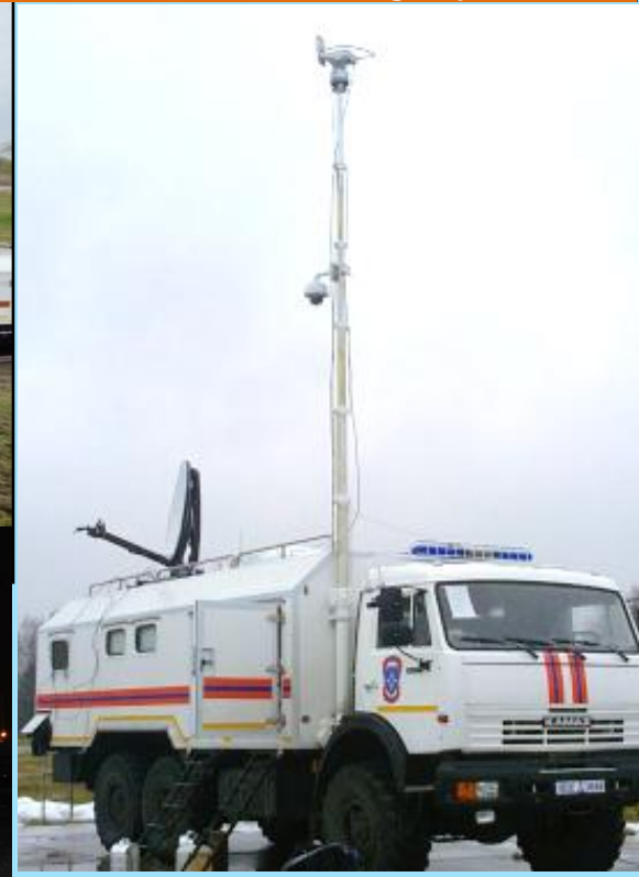
Mobile signal centre