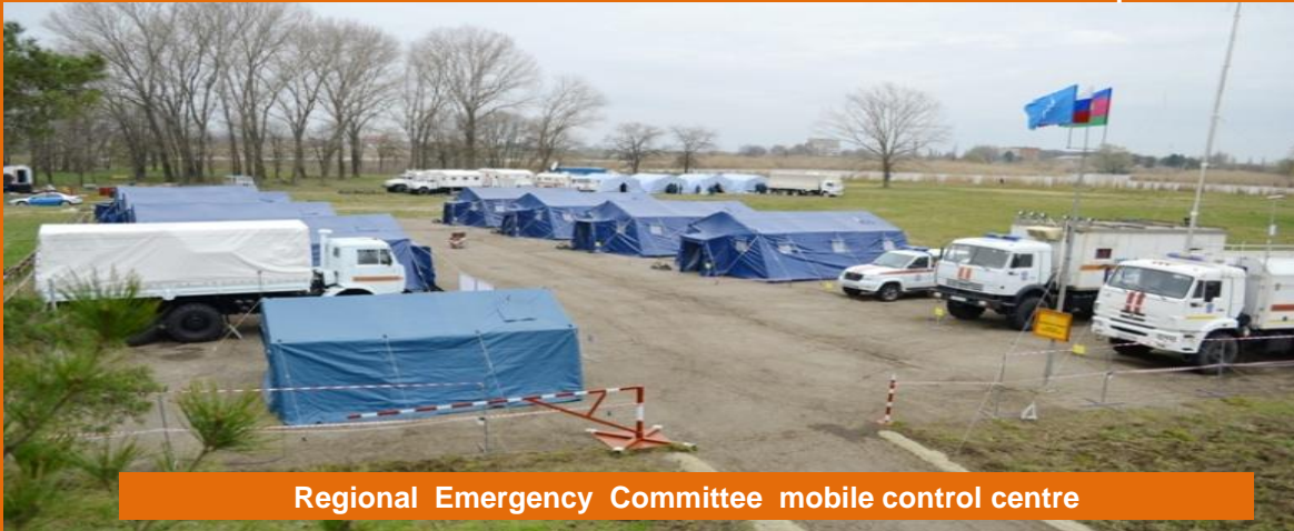
Regional Emergency Committee mobile control centre