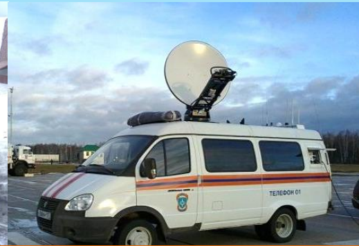
Mobile signal post